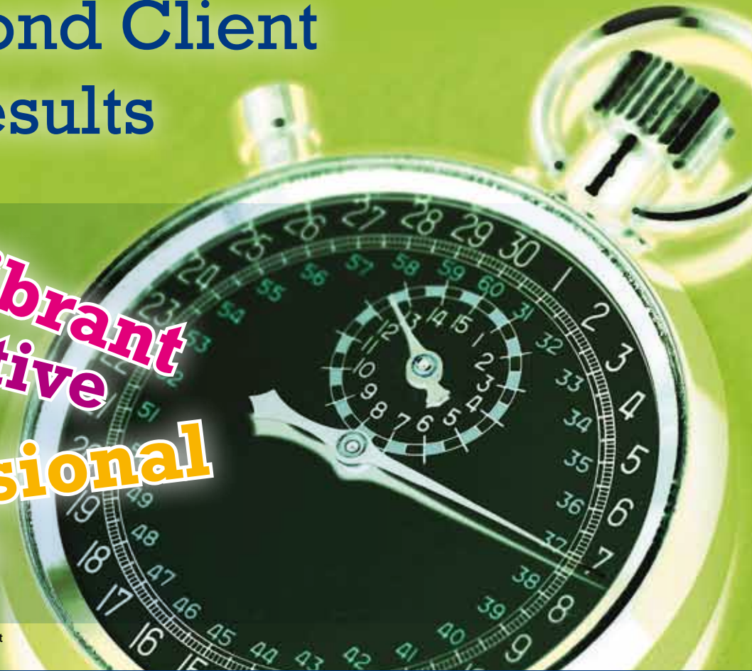
Some of the words you used to describe Marketing Impact

Vibrant Innovative Creative Professional Fun